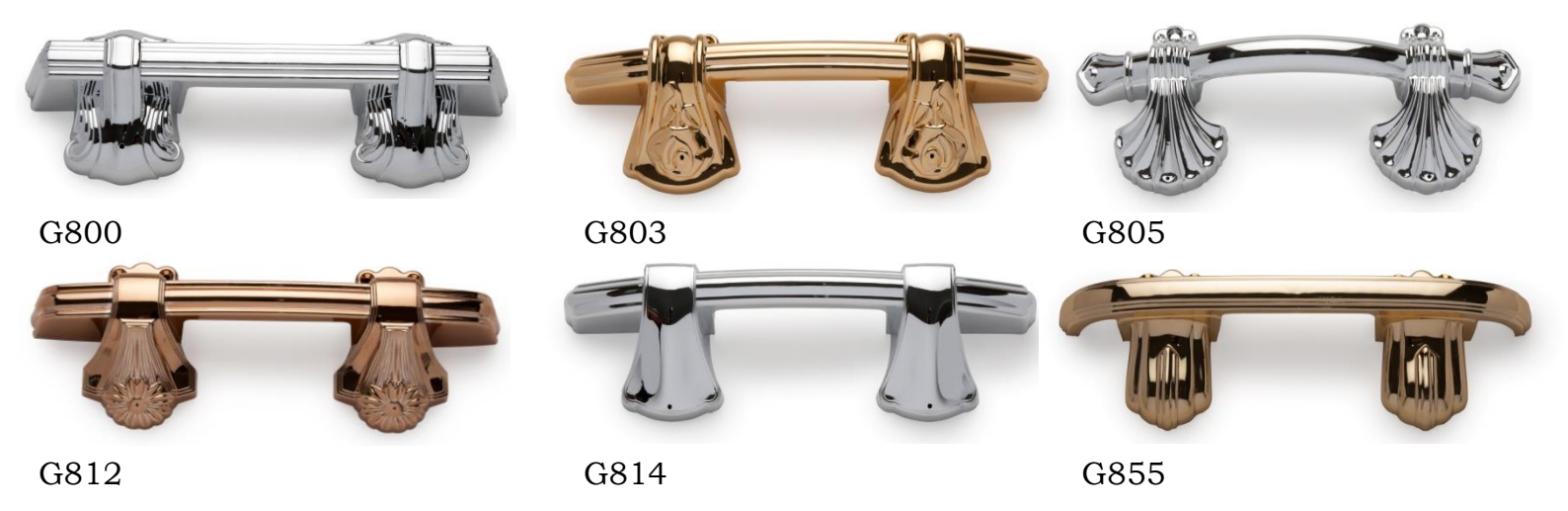
Handles – Swing Bar – available in Gold, Silver, Bronze and Wood Bar. Stains available – Mahogany, Rosewood, White, Black, Walnut and Cedar.

Handles - Fixed - available in Gold, Silver or Bronze